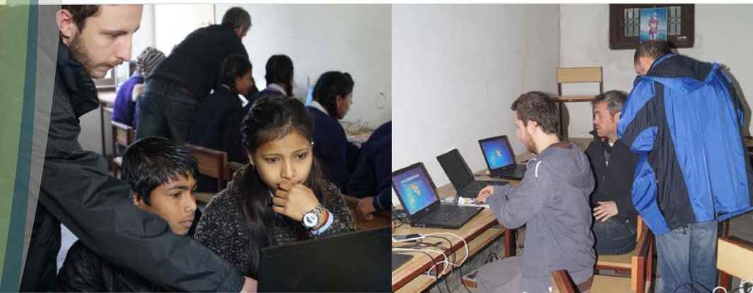
The Artelia Foundation's assignments