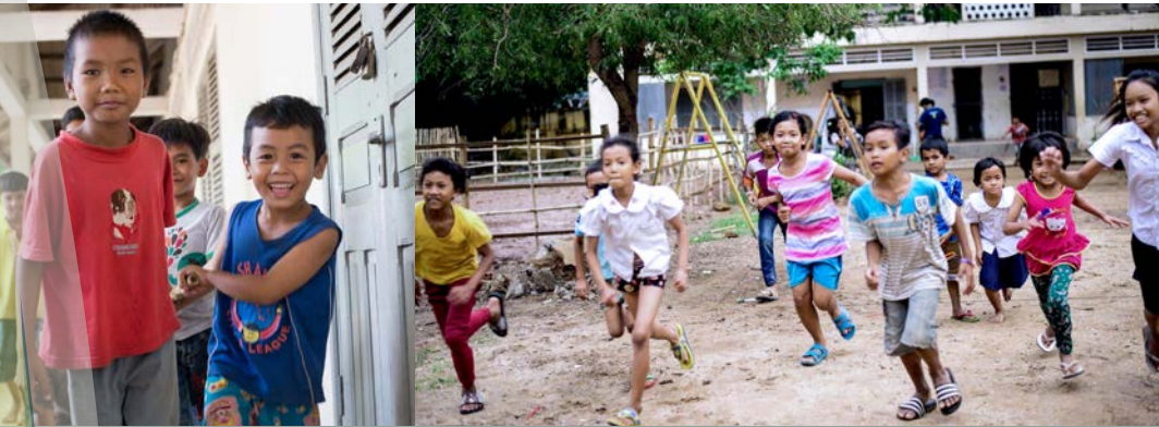
The Artelia Foundation's assignments