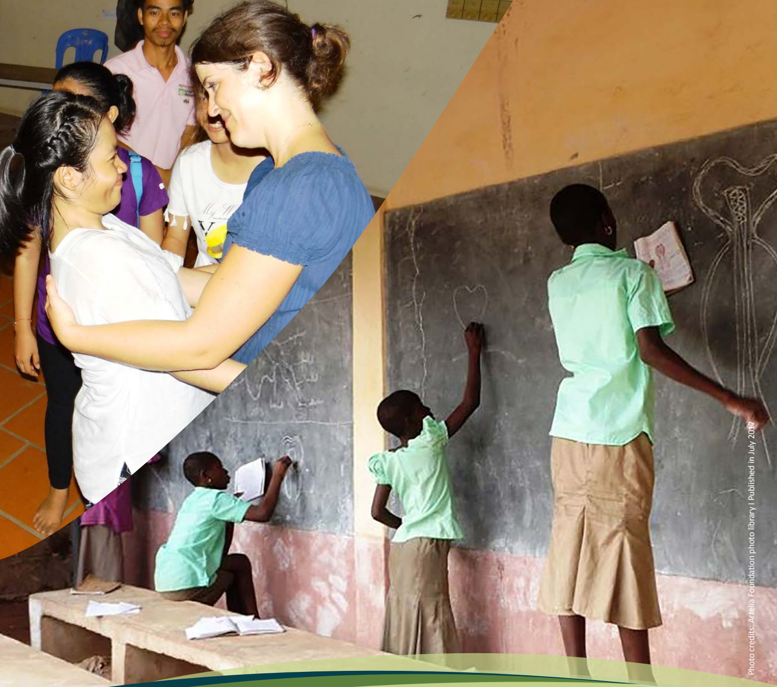
Published in July 2017